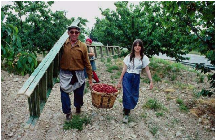
How are this man and woman related? The image's source doesn't say. The inter-dependence of the sexes goes beyond marriage to embrace all types of male-female relationships.