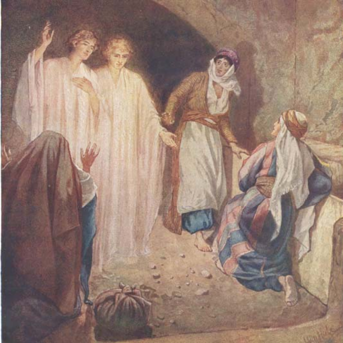
Detail from a painting by William Brassey Hole (1846 – 1917). It depicts the appearance of two angels to the women in the empty tomb: "... behold, two men stood by them in dazzling apparel." (Luke 24.4).

And God's angels help people – for example an angel released the apostles (Acts 5.19) and, later, Peter from prison (Acts 12.7-11). The Lord gives angelic protection to those who trust Him (see Psalm 91.11-12). Angels ministered to Jesus Himself whilst He was on Earth (Matthew 4.11, Luke 22.43). And they minister for the benefit of God's children, too (Hebrews 1.14).