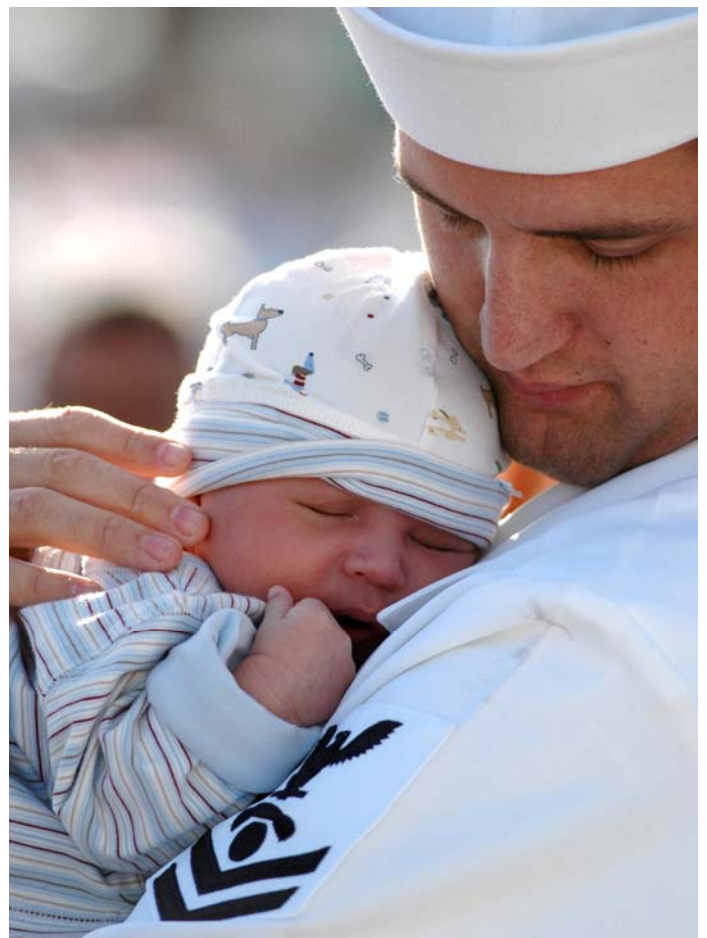
A naval officer embraces his newborn son for the very first time on his arrival in Hawaii after a six-month deployment. Children are the 'image' of their parents. They bear a family 'likeness'. We humans, too, bear the "image" and "likeness" of God. And how precious must be this little baby to his father. We are very precious to God.