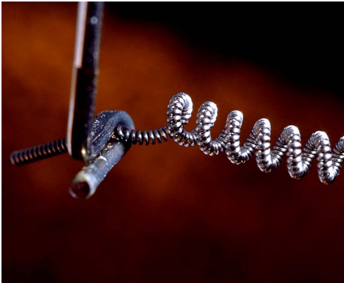
A highly magnified photograph of the filament of a 200-watt incandescent light bulb – illustrating the inter-relationship of spirit, soul and body as explained above.

When electricity passes through the filament, it (so to speak) expresses itself as light. This illustrates how God created Adam. When He breathed a human spirit into Adam's body, Adam's spirit began to express itself through his body as soul . In other words, Adam became "a living soul" . In simple terms, then, my soul is my spirit expressed through the medium of my body.