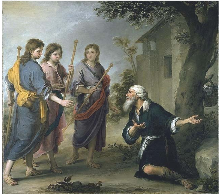
Abraham and the Three Angels' painted by Bartolomé Esteban Murillo (1617-1682) and held by the National Gallery of Canada. Notice how the artist portrays the angels as ordinary men.

Neither do angels relate to God as we do. Through Jesus Christ's work on the Cross, God's people are as closely related to Him as any created being can be. God's people are married to the Lamb - angels are not. Christians call God Father, angels do not. God indwells His people, but He doesn't indwell angels.