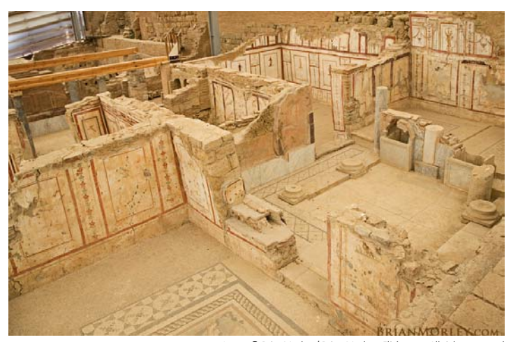
The world of the early Church (3). These highly decorated upper class homes at the site of ancient Ephesus give us a striking insight into the lives of the urban well-to-do in Roman times. They date mainly to the 1st and 2nd centuries AD, and so to the period of the early church in Ephesus. These houses had windowless rooms accessed and lit from a central open courtyard. All the houses had running water, with fountains either built into the courtyard wall or free-standing. A system, similar to those used for public baths, was used to provide under-floor heating. They were mostly two-storeyed; the upper storeys have collapsed.

The gifts of the Spirit are also our foretaste of the age to come. He gives us messages of wisdom and knowledge and prophetic revelations. But "we know in part and we prophesy in part" (1 Corinthians 13.9), "we see in a mirror dimly" (1 Corinthians 13.12). But in the world to come we'll see God "face to face" (1 Corinthians 13.12); our understanding will be transformed. Now God grants His people gifts of healings. But one day our bodies will be perfectly healthy – there'll be no more pain, no more disease, no more death.