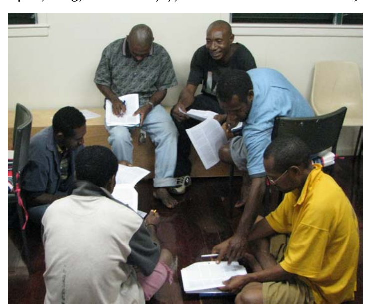
Studying the Bible together. The Scriptures are foundational to the Spirit's work of teaching us. There can be tremendous blessing in studying it together and helping each other to understand it.

And now God shares His secrets with us, His Church. Jesus said to His disciples: "'...I have called you friends, for all that I have heard from my Father I have made known to you'" (John 15.15). God's Holy Spirit teaches us (John 14.26, 16.13, 1 John 2.20,27, and see 1 Corinthians 2.11-12).