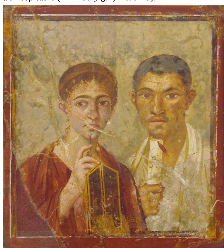
The world of the early Church (5). This fresco, now in the Naples National Archaeological Museum, was found in a building in Pompeii. It's held to be a portrait of a man called Terentius Neo and his wife. The two are portrayed as a well-to-do and cultured couple, but they may well have had a more humble origin. It's a realistic depiction of a Roman couple, and brings to mind Priscilla and Aquila, Paul's hosts in Corinth and hosts of the church in Ephesus. The woman has the hairstyle typical of the period of the emperor Nero (AD 54-68), and holds a hinged writing tablet and stylus. The man wears a toga, indicating the status of a Roman citizen and further, perhaps, a rank of magistrate. He holds a rotulus, a roll for writing on.

As churches met in private homes, hospitality was basic to church life. Appropriately, a requirement for eldership is to be hospitable (1 Timothy 3.2, Titus 1.8).