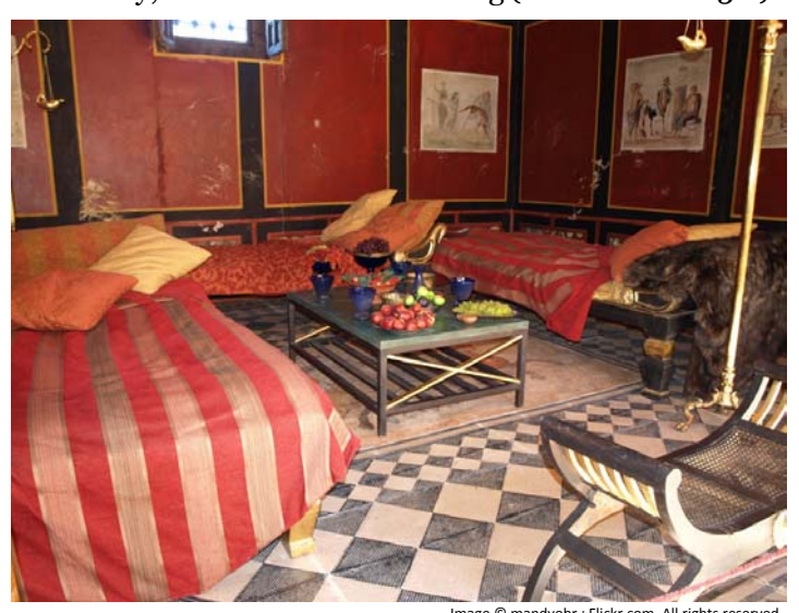
The world of the early Church (4). Room constructed and furnished in the style of a Roman dining room. It's in the interpretive centre called 'Domus' at the ruins of the Roman town of Juliobriga in northern Spain. This pictures the kind of setting in which some early Christians might have gathered and celebrated the Lord's Supper, if hosted by a well-to-do household.

▶ Most of all – we must love one another with our gifts The gifts are to be used as expressions of love (see 1 Corinthians 13.1-13) – not so we can puff ourselves up or serve our own ends. Even if I were the most gifted member of the body, without love I am nothing (1 Corinthians 13.2).